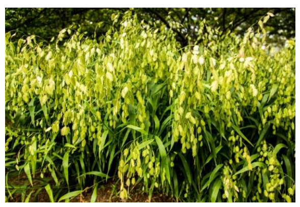
Figure 8: A large group of Chasmanthium latifolium individuals.

the northern successional field, specimens have really taken a hold, with tens of tussocks spreading towards the middle of the property where they are growing in both open sun and partial shade under some of the nearby shrubby trees. Multiple online sources describe its native range as extending into extreme southwestern Michigan; the only wild populations suggested by Michigan Flora<sup>[1]</sup> and the Michigan State University Natural Features Inventory<sup>[2]</sup> are from a mature floodplain in Berrien County in the very southwest corner of the state.