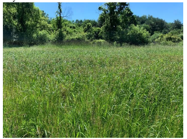
Figure 6: The wetland habitat, with many Scirpus spp. present.

Along with the dominating bulrush tussocks are Soft-stemmed rush (Juncus effusus), Dudley's rush (Juncus dudleyi), and Redtop (Agrostis gigantea). A new record for Kent county<sup>[1]</sup> found within this habitat is Sweet-flag (Acorus calamus), a colony of which is close to the southwestern edge of the wetland. This species is introduced from Eurasia and only reproduces vegetatively (spreading by horizontal underground stems), which suggests that this species was planted in the wetland.