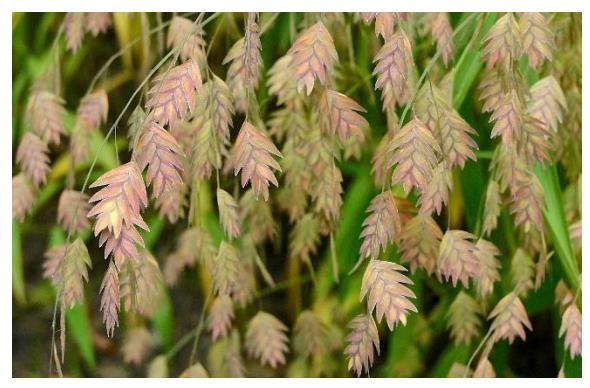
Figure 7: Close up of Wild-oats ( Chasmanthium latifolium ).

Of special note are two aforementioned species, one native and widespread south of Michigan, and one introduced. Wild-oats ( Chasmanthium latifolium ) is frequently cultivated as "Northern