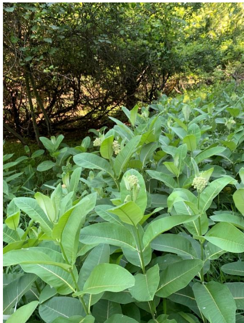
Figure 5: A group of Common milkweed plants ( Asclepias syriaca ) close to the stream in the eastern hardwoods/shrubland habitat.

3) Eastern Hardwoods/Shrubland (Includes Pine Plantation): This is the largest of the habitats at this site and is located towards the southeastern and eastern sides of the property. It includes an area of Red pine ( Pinus resinosa ) which represents a remnant pine plantation—with the trees growing in neat rows. Other trees in this section of the property include Red maple ( Acer rubrum ), Sugar maple ( Acer saccharum ) Boxelder maple ( Acer negundo ), Paper birch ( Betula papyrifera ), American ash (Fraxinus americana), Black walnut ( Juglans nigra ), Quaking aspen ( Populus tremuloides ), and