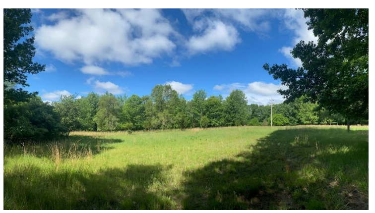
Figure 4: The northern successional field habitat in the 32<sup>nd</sup> Street Property.

this habitat. These specimens represent a new county record, since Giant foxtail has been documented in a few surrounding counties but not Kent County (Michigan Flora database<sup>[1]</sup>). There are also a few species of Violet ( Viola spp.), Common spiderwort ( Tradescantia ohiensis ), Goat's beard ( Tragopogon dubius ), and various other relatively weedy forbs (herbaceous dicots).