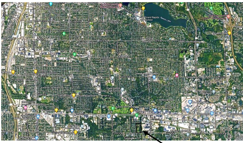
Figure 2: A Google Maps zoomed-out satellite view of the 32<sup>nd</sup> Street Property for the context of its location in Grand Rapids.; it is the small black box on the southern edge of the image (black arrow points to it for further reference).

This property is situated within 4 busy roads in southeastern Grand Rapids: 32<sup>nd</sup> St SE (south edge of the property), Kalamazoo Ave SE (west), 28<sup>th</sup> St SE (north), and Breton Rd SE (east). More specifically, this parcel is directly east of the Maple Villa residence complex, extending roughly 1000 feet north to south, and roughly 550 feet east to west (about 17 acres). Residential areas bound the northern, western, and southern edges of the property, and an industrial park is to the east. There are a few properties to