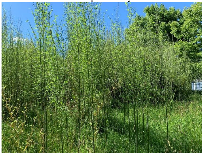
Figure 9: The colony of Phyllostachys nigra in the southern successional field.

( Phyllostachys nigra ), and its presence is more troublesome. This is an aggressive invasive plant from China which has previously been discovered at a single locality in Berrien County in